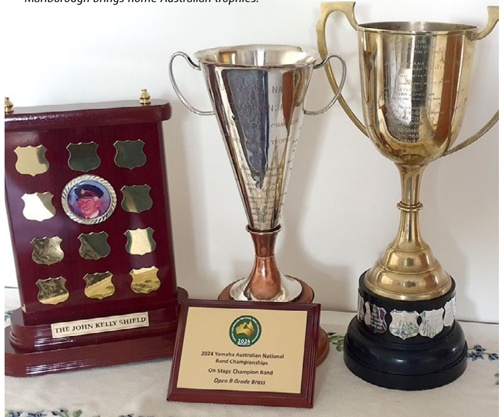
Marlborough brings home Australian trophies.